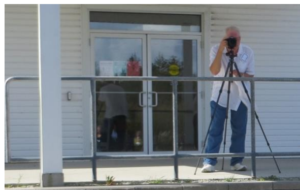
The group was captured by Governor Bill Curry