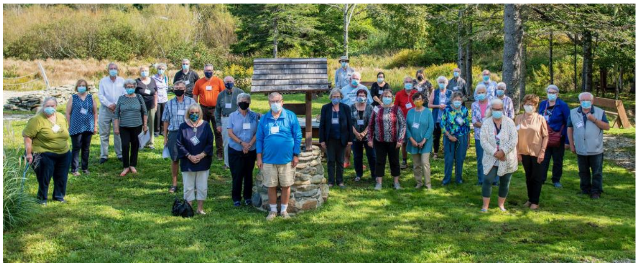
Nova Scotia Colony Fall AGM

The Nova Scotia Colony of Mayflower Descendants held its AGM on September 25, 2021 at Arcadia, Yarmouth County, NS.