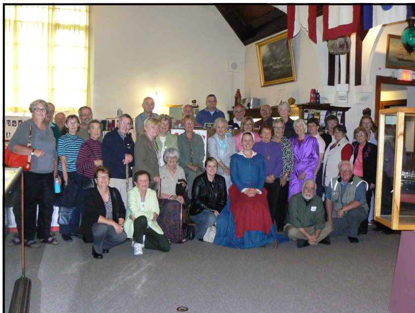
Nova Scotia Colony Fall Meeting