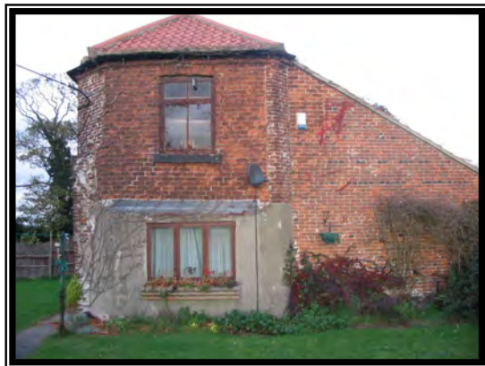
The Manor House, Scrooby