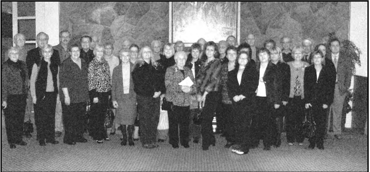
Members in Attendance at the Fall Annual General Meeting