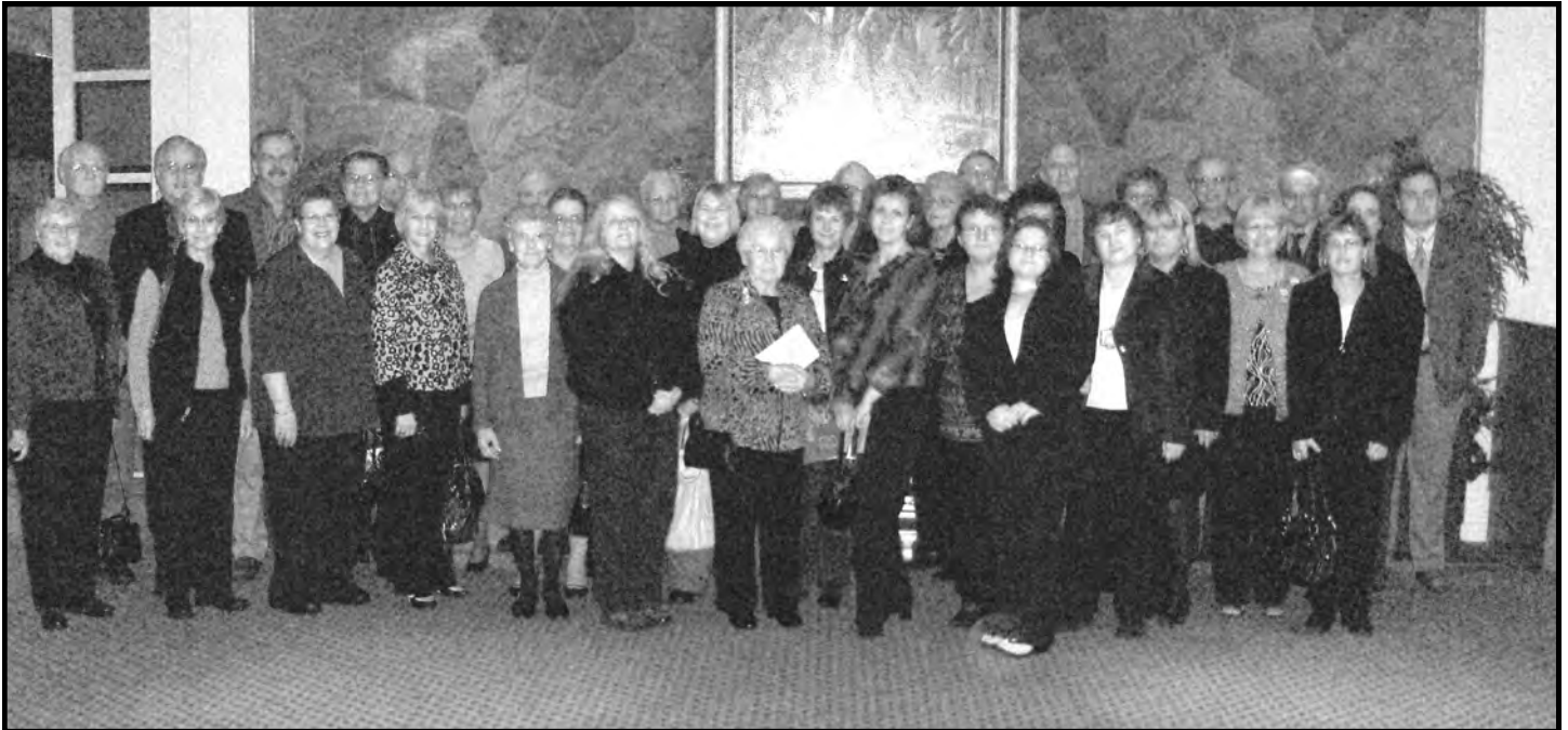
Members in Attendance at the Fall Annual General Meeting